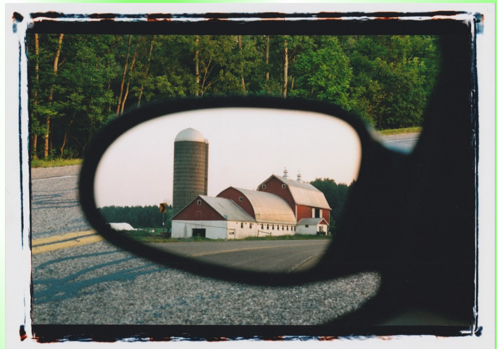
LAST LOOK, 2004, 35MM C-PRINT, PENTAX K1000, 50MM LENS